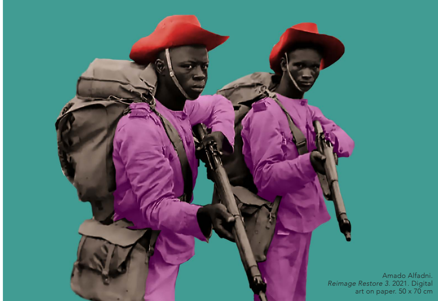
Amado Alfadni. Reimage Restore 3. 2021. Digital art on paper. 50 x 70 cm